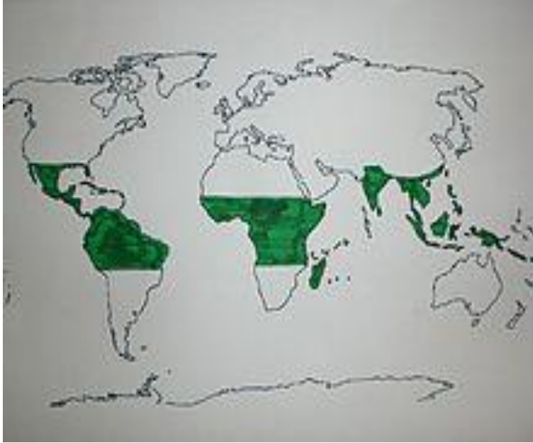
Figure 2 : Jatropha distribution [11]

Although is an open-field plant species, it requires intense sun such as found in the savanna or desert periphery. It is not adapted to grow under the shadow of forest canopy and does not compete with fast-growing species of the rain forest. It is well adapted to arid and semi-arid climates, and can resist to adverse environmental conditions. J. curcas can grow on a large range of soils provided they are well-drained and aerated.